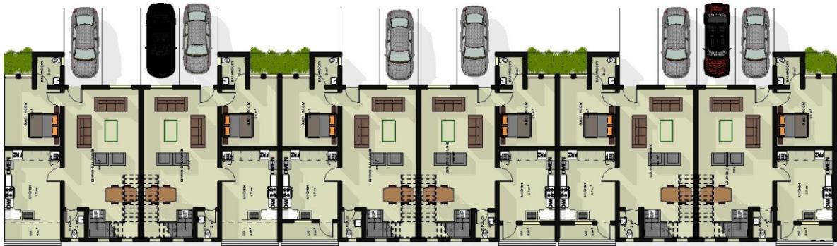
GROUND FLOOR PLAN 4 BEDROOM TERRACE DUPLEX