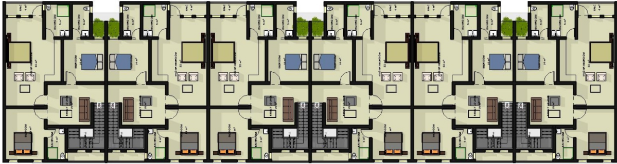
FIRST FLOOR PLAN 4 BEDROOM TERRACE DUPLEX